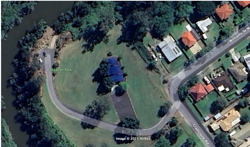
Put in Point