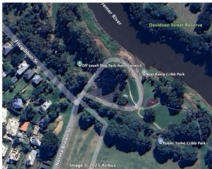
Cribb Park (toilets)