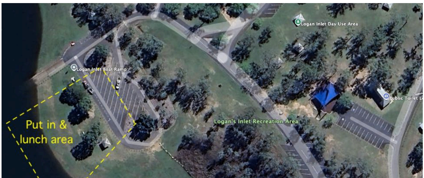
Near Logan Inlet Boat Ramp