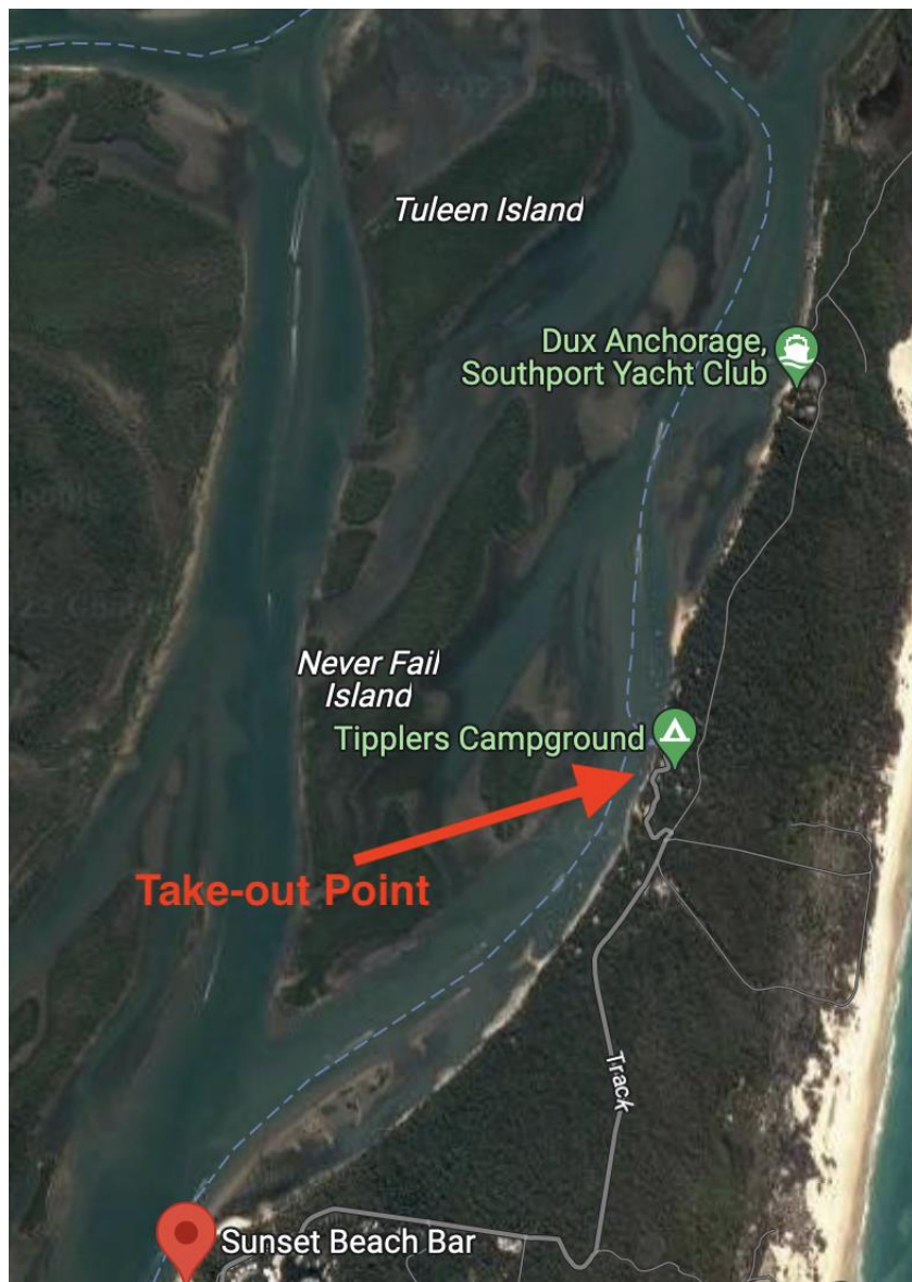
Take Out in Point